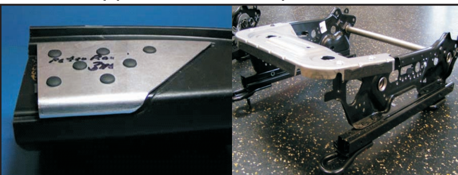
汽车迎宾踏板 Auto Sillboardcover Assembly